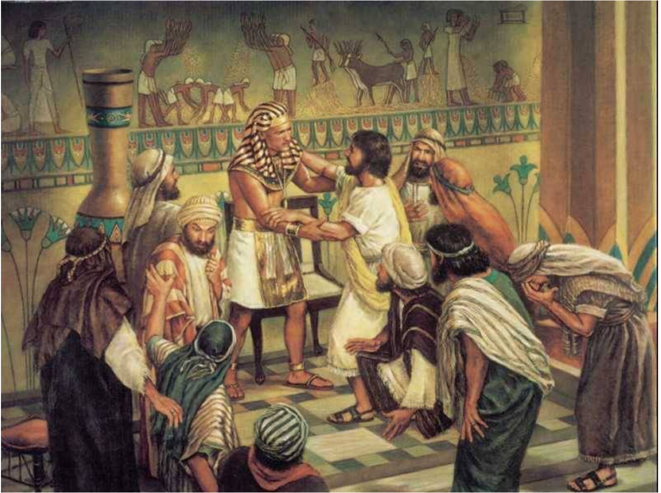
Joseph saved his brothers and tribe